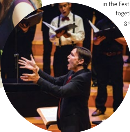
Students who participated in the first Festival in 1990 would be in their early 40s today!