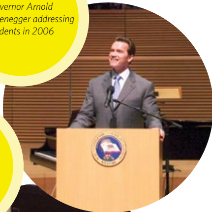
Governor Arnold Schwarzenegger addressing students in 2006