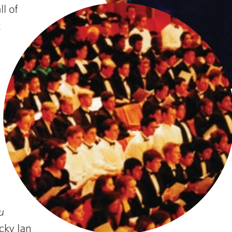
7 different pieces by Handel have been performed (including 3 performances of the Hallelujah Chorus)