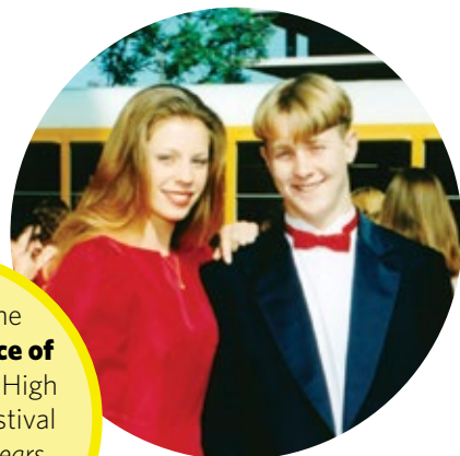
This will be the 4th performance of Dirait-on at the High School Choir Festival (with previous years being 1999, 2000 and 2010)